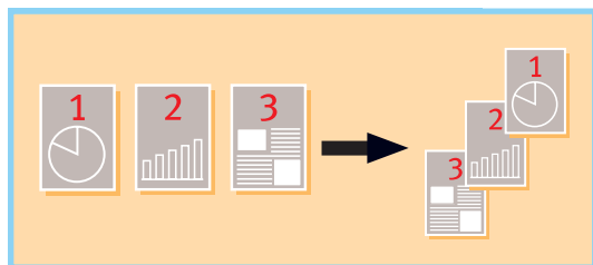
Collated Print-in-order Output (1670F)

What's more, the default setting on incoming fax documents provides face-up, in-order receptions that are collated last page first, first page last, so you don't need to spend time organizing and sorting pages.***