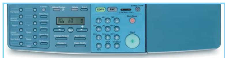
User-friendly Operation Panel