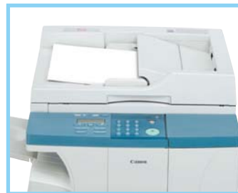
Automatic Document Feeder